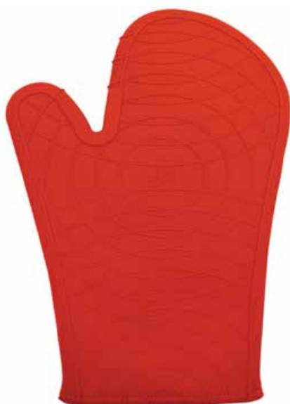
Figure 1. Mitt